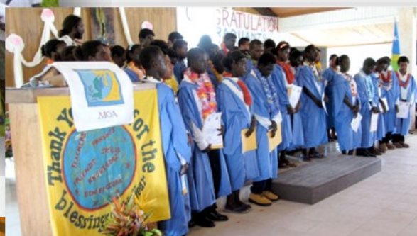
St. John Bosco, Tuha graduation, 21st November