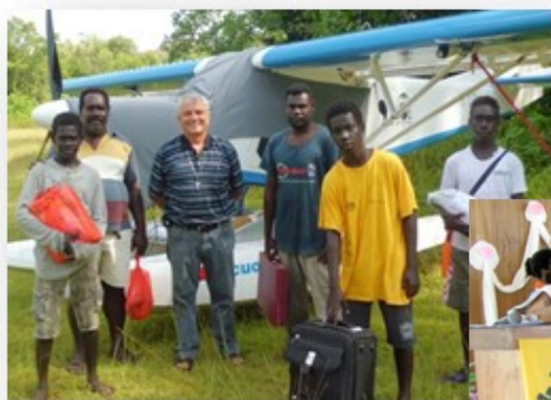
Flying Bishop on the arrival at Balalae

The celebrations which took place on the 19th to 21st of November tell of the growth of the Catholic Church in establishing partnership with the ministry of education as a controlling authority for the Diocese of Gizo as of this year.