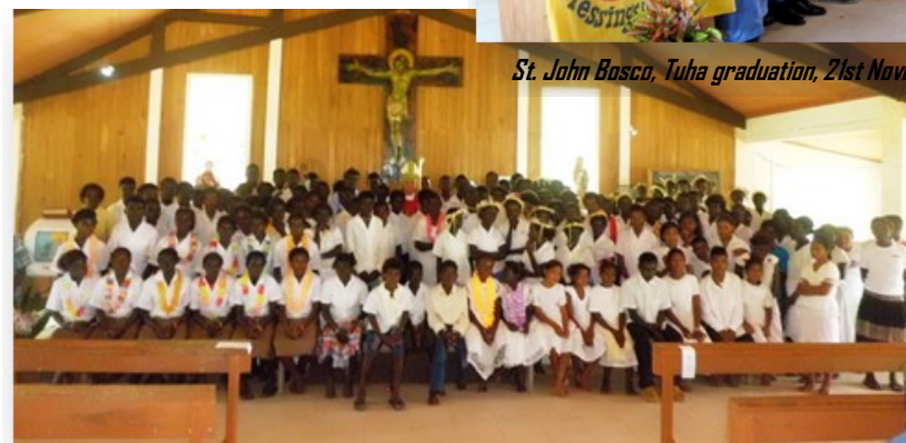
About Hundred received Confirmation on the 20th November

The achievement consists in joining the three levels of education in Nila into a single school: Primary, Junior and secondary school united to make strength to achieve better goals. The primary has an enrollment of 102 students, the junior secondary 192, the senior secondary counted 76 students for form 4, to double in 2012 form 5 and triple in 2013 with form 6 (Both with Academic and TVET streams). 22 teachers have assisted our students for this past year. The 4 schools at Nila have merged into one administration marking the way to our common success. We will continue to be one, feel one to build unity. Only in this way we can give the right direction and make a difference with our youth.