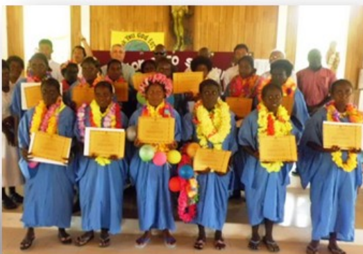
St. Anns Vocational graduation, 19th November